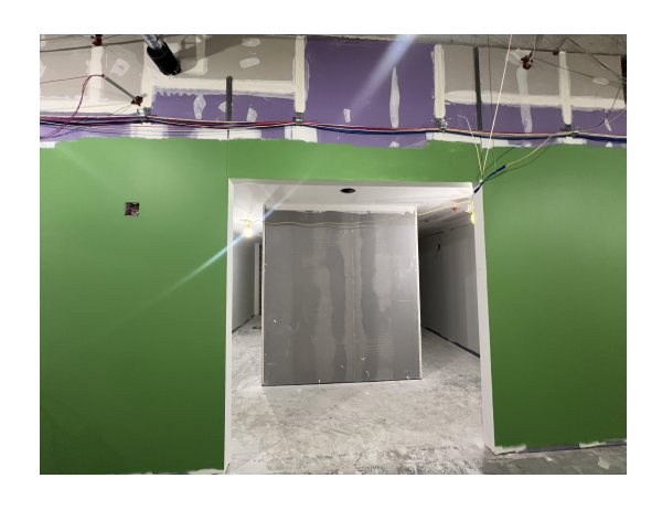
Painting in the restrooms on level 2.