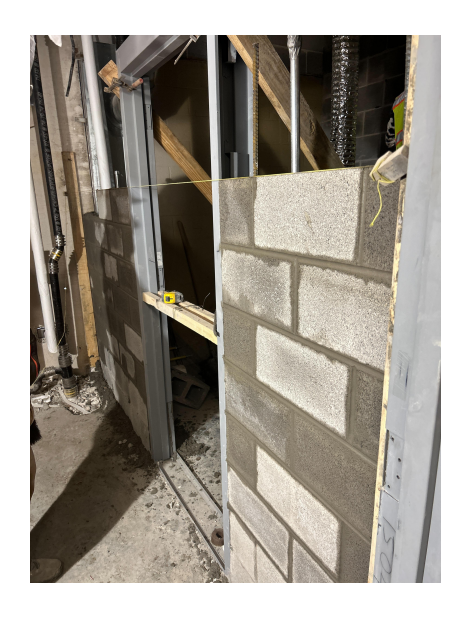
Setting door frame and CMU installation in kitchen on level 1.