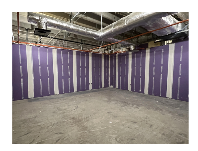
Preparing to paint in classrooms on level 1.